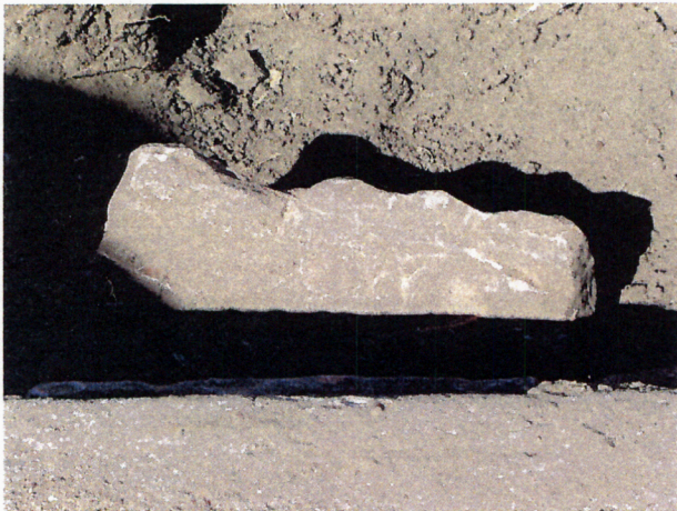
Figure 1 - Original stone monument uncovered.