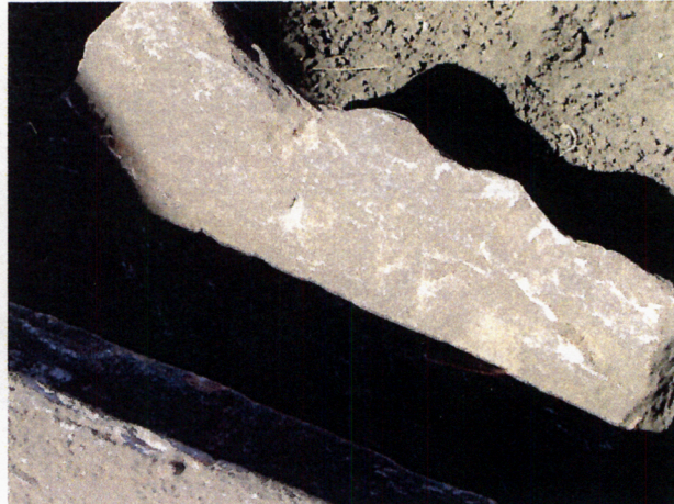
Figure 2 - Chiseled "NW" visible.