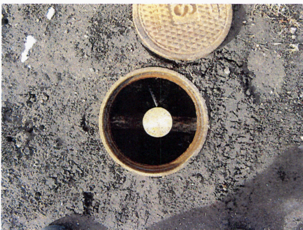
Figure 3 - 3 ¼" Brass Cap and cast iron box set over found stone.